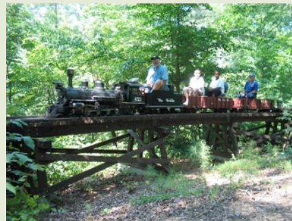
The Canton, St. Paul & Pacific live steam railroad

NAOGRRC members last visited the live steamers about 3 or 4 years ago and I believe it safe to state that everyone who